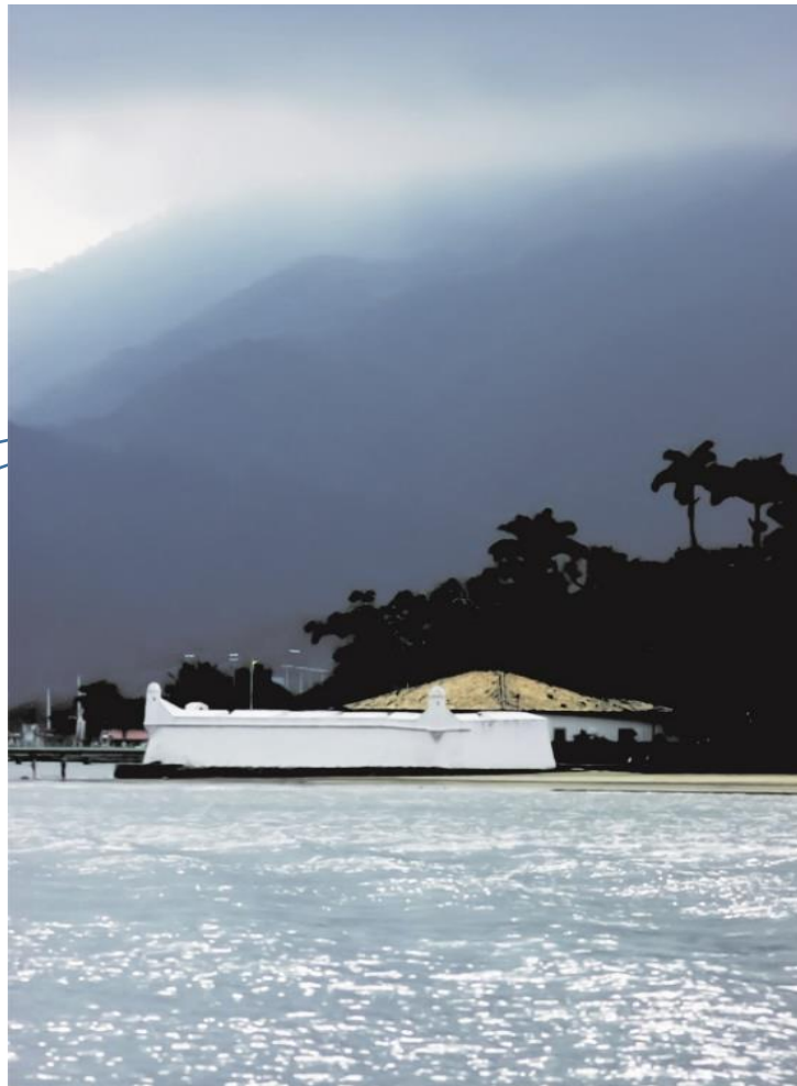
16_ Forte São João, 1532 / 1551 São Paulo